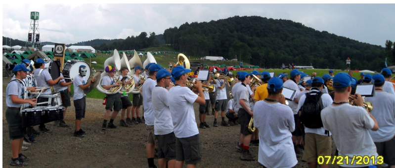
Jamboree Band performing one of its many subcamp shows at Alpha 3