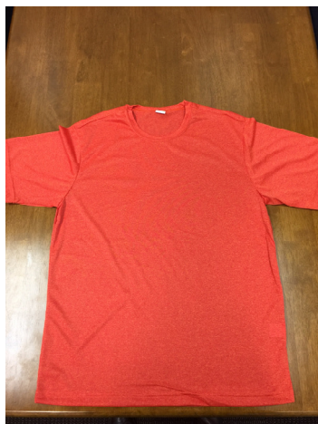
Wicking T-Shirt A pre-shrunk cotton t-shirt will also be available.

"We hope that having numerous options will allow everyone to find something that is comfortable for them."