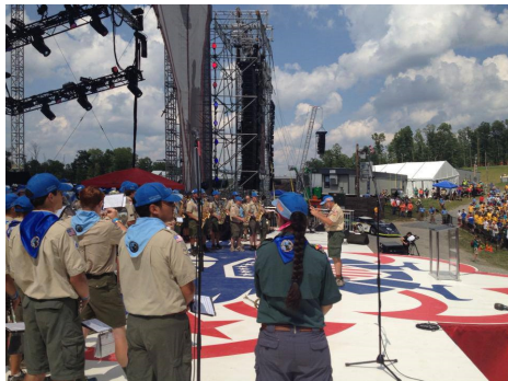
Jamboree Band playing live on stage at the AT&T Stadium

"One might imagine what it would be like to perform at a large rock concert ...."