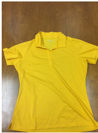
Women's Wicking Polo (shown for style, color will be orange)

Join us on Facebook at "Jamboree Stadium Experience"