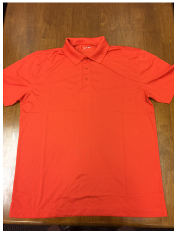
Men's Wicking Polo