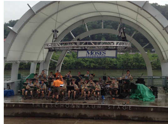
(Above) Jamboree Jazz Band performs at the Live on the Levee community show in Charleston, WV during the 2013 National Jamboree.